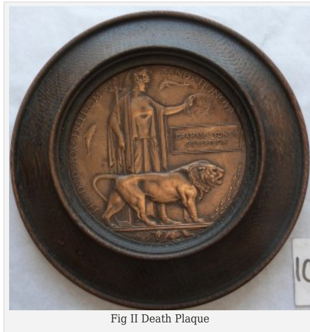
Fig II Death Plaque

Figure III is a ration book which is dated 6th July 1918 belonging to a local family of the name Waldock. Rationing was not introduced until February 1918 and was a response to an increase in German U-boat activity in the Atlantic. The Defence of the Realm Act (DORA) had been established in 1914 in order to ensure food shortages did not occur, in spite of initial panic buying in 1914 the population settled well into a routine until late in 1916. Britain relied upon food imports from Canada and America and until 1916 this was a relatively safe business, however in 1917 German U-boat activity increased and merchant ships were attacked. This resulted in DORA issuing a self-rationing policy which, unfortunately was not sufficiently effective and the continuing U-boat activity in the Atlantic meant that malnutrition was becoming a problem by 1918. In January 1918 sugar was rationed, and by the end of April butter, margarine, cheese and meat were added to the list. The decision to introduce rationing was shown to be the correct one as levels of malnutrition decreased.