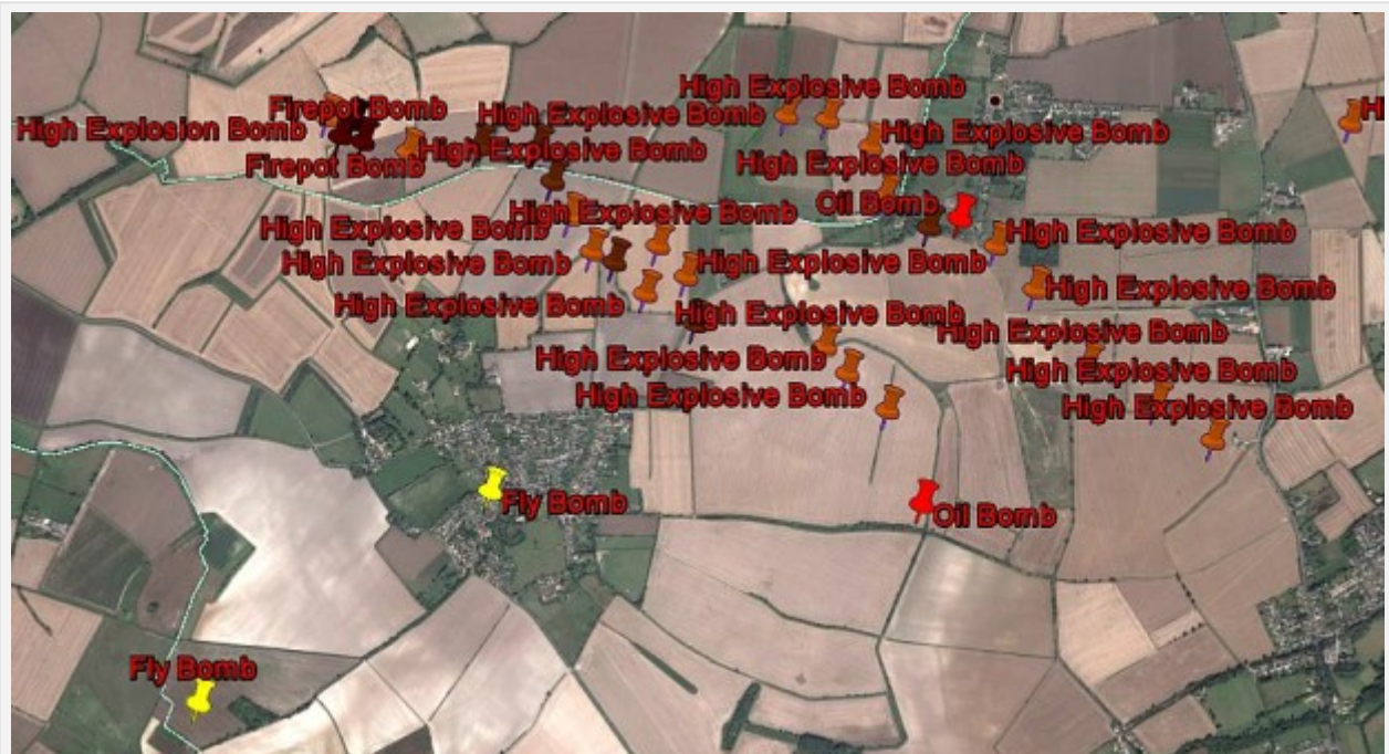
Bombs dropped between Pirton and Holwell on a modern background

North Herts Museum update: a Second World War map of local bombs Swastika (the symbol most typically associated with the Nazis during World War Two).