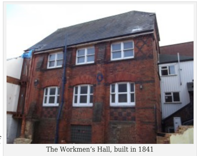
The Workmen's Hall, built in 1841