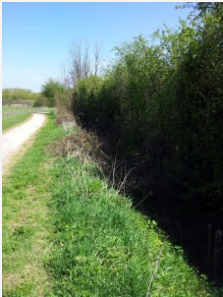
Stodfaldes Dic ("Stotfold Dyke"): an earthwork over a thousand years old, as it appears today

enclosure road) to the county boundary. The hedgerow sits on a slight bank and there are stumps of dead and clearly very old hawthorns along its line. The hedgerow does not appear on the Inclosure Map, but then nor does Standalone Farm. I am left wondering how accurate the map is for this part of the parish.