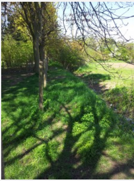
Hedgerow bank north-east of the Grange Playing Field

Following the modern farm track south-west from Stotfold Road brings you to a turn to a north-westerly direction and then to a boundary crossing it at a right angles, followed by a drain in a ditch. To the north-east, the boundary is composed of scrubby woodland, but to the south-west, it follows a species rich boundary that includes mature trees. The field surface to the north-west of the boundary lies about a metre lower than the path and the field to the south-east, once again suggesting an ancient origin. This boundary is also shown on the 1796 map. The track then meets the corner of the Grange Playing Field, where LIDAR data shows that ridge-and-furrow earthworks survive (although I could not see them in the strong sunlight today). Following the boundary along the north-eastern side of the playing field, the hedgerow is thick and on a bank, while the field to the north-east is about a metre lower than the playing field. Passing beyond the end of the playing field and still continuing to the south-east, the hedgerow continues on a significant bank.