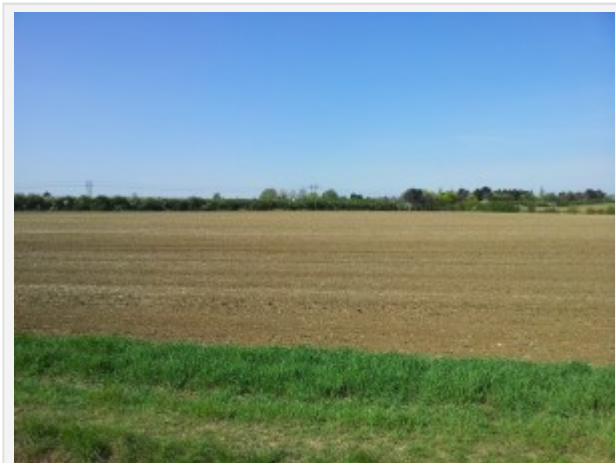
Field and hedgerow north-east of the Grange Estate

As it was a beautiful morning, I decided that today would be a good time to go back into the fields armed with maps that I could annotate. My intention was to note the principal character of the hedgerow, to determine whether or not it had a bank and to look at differences in height between the ground on either side. These changes happen on sloping ground, where soil moves downhill during ploughing; if there is a hedgerow (or some other boundary, such as a road) in the way, soil will pile up on the uphill side and be eroded on the downslope side. As this sort of soil creep is quite slow, it is a good indication of the antiquity of the boundary; it is even more telling when one or both of the fields are under pasture, meaning that the ploughing that caused the movement of soil was itself ancient.