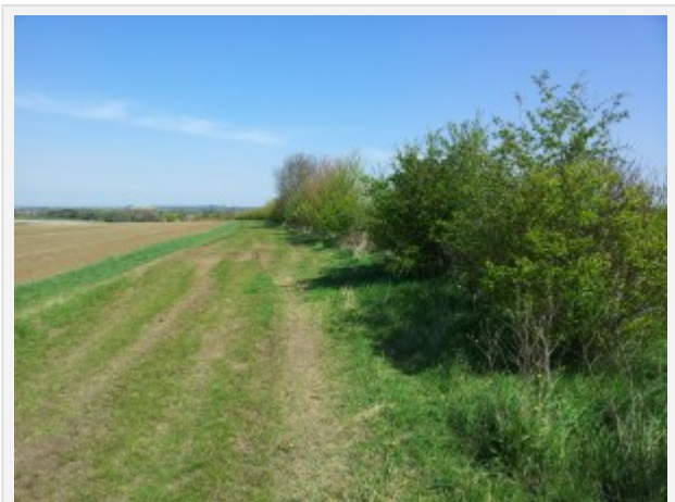
The track that was " the way to Stotfold " around 1700

I started from the village pond, by the junction of Croft Lane and Norton Road. From here, the Garden City Greenway leads north-north-west, alongside a plain hawthorn hedge with no bank. It runs between two surviving bits of ridge-and-furrow cultivation, the easternmost of which was surveyed by a team from North Herts Museums in January 1986. The Greenway passes through another plain hawthorn hedge with no bank and turns left to follow a hedge trending more to the north-west that again had no bank and appeared to be mainly hawthorn. I followed the path that crosses the field, along the line of a track marked as the way to Stotfold on an anonymous map of c 1700 . This passes