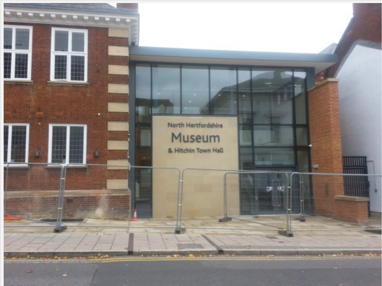
The lettering with our name is now up at the entrance