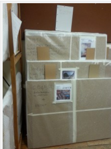
Paintings wrapped and labelled ready for the move