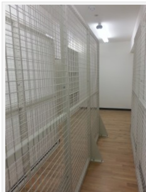
Part of the new secure art store