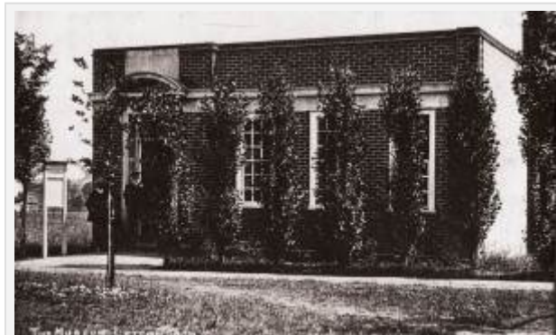
First single storey building of Letchworth Museum 1914

One hundred years ago, the first part of Letchworth Museum was finished and opened to the public.