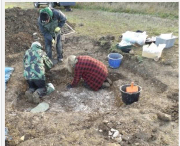
Excavating the burial at Kelshall in November 2014