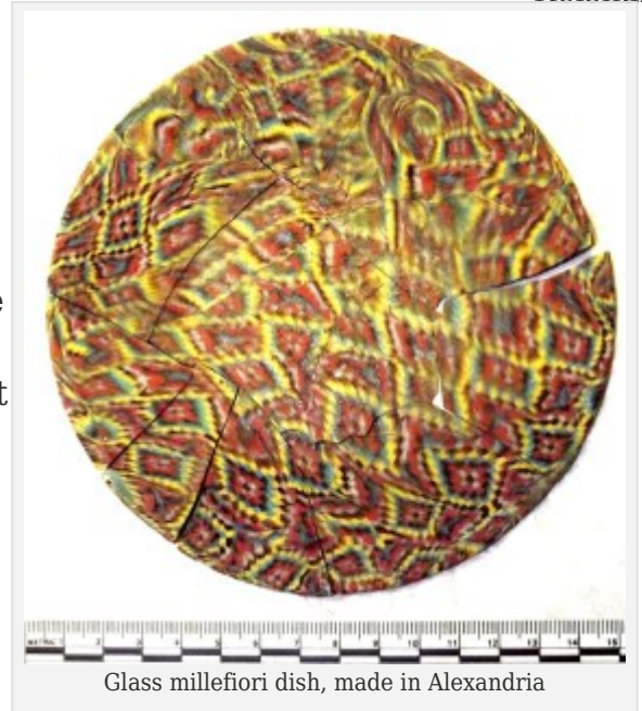
Glass millefiori dish, made in Alexandria

After 1800 years, finds like these still impress us with their workmanship. Working together with the metal detectorist, NHDC's archaeologist and the Finds Liaison Officer, were able to uncover the past and find out and understand so much more about the lives of people in Roman North Herts.