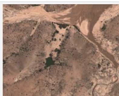
The hill where this tool was found is in the centre of the photograph